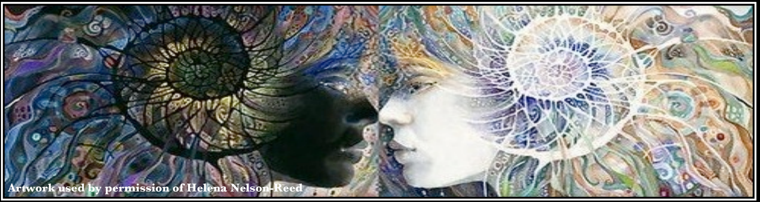
Artwork used by permission of Helena Nelson-Reed

Boulder, CO Fri. Sept. 22 nd , 5-9:30pm, Sept. 23 rd , 9am-6pm, Sept. 24 th , 9am-4pm